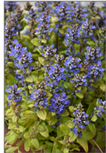
Feathered Friends Fancy Finch Bugleweed flowers