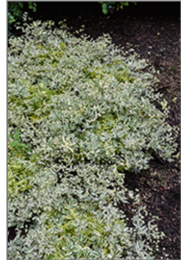
Golden Feathers Jacob's Ladder foliage

Golden Feathers Jacob's Ladder is recommended for the following landscape applications;