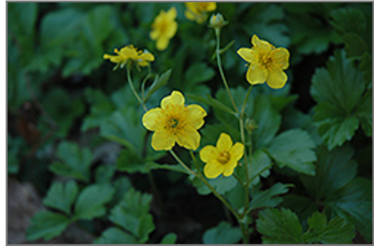
Barren Strawberry flowers