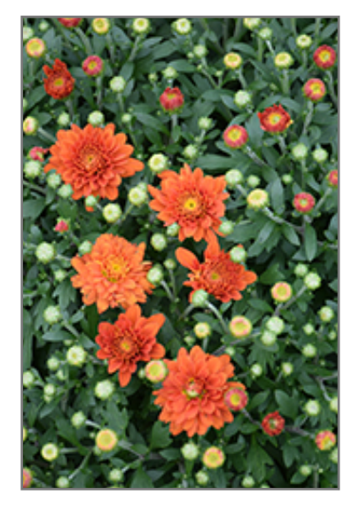
Orange Zest Chrysanthemum flowers