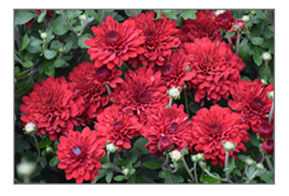
Radiant Red Chrysanthemum flowers