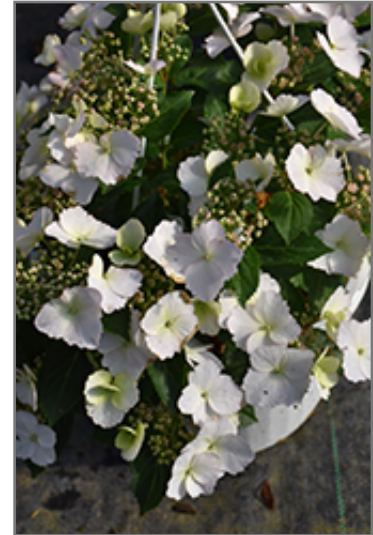
Fairytrail Bride Cascade Hydrangea flowers