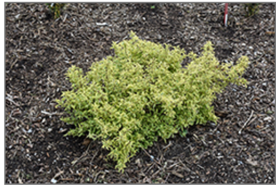
Bubbly Wine Weigela