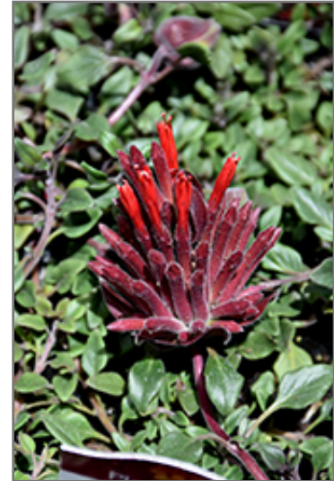
Marian Sampson Scarlet Monardella flowers

This is a relatively low maintenance plant, and should not require much pruning, except when necessary, such as to remove dieback. It is a good choice for attracting hummingbirds to your yard. It has no significant negative characteristics.