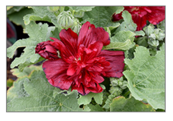
Spring Celebrities Red Hollyhock flowers