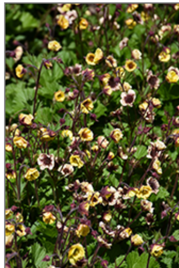
Tempo Yellow Avens flowers

Tempo Yellow Avens is recommended for the following landscape applications;