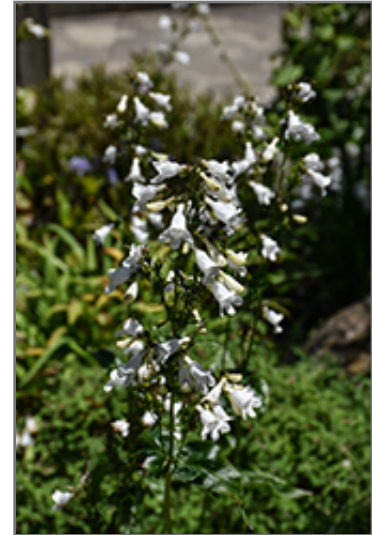
Foxglove Beardtongue flowers

Foxglove Beardtongue is recommended for the following landscape applications;