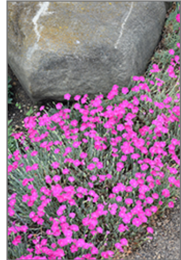
Firewitch Pinks in bloom

Firewitch Pinks is a fine choice for the garden, but it is also a good selection for planting in outdoor pots and containers. It is often used as a 'filler' in the 'spiller-thriller-filler' container combination, providing a mass of flowers and foliage against which the thriller plants stand out. Note that when growing plants in outdoor containers and baskets, they may require more frequent waterings than they would in the yard or garden.