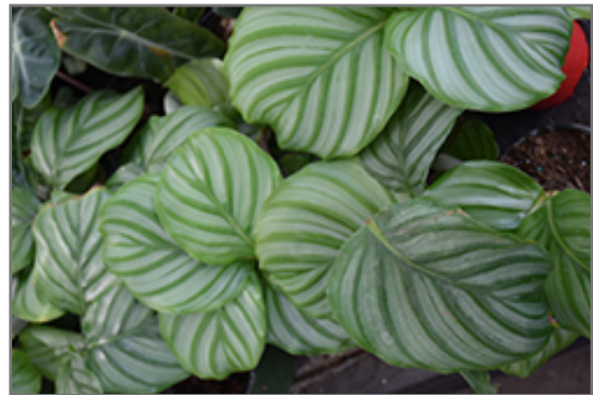
Color Full Orbifolia Prayer Plant foliage