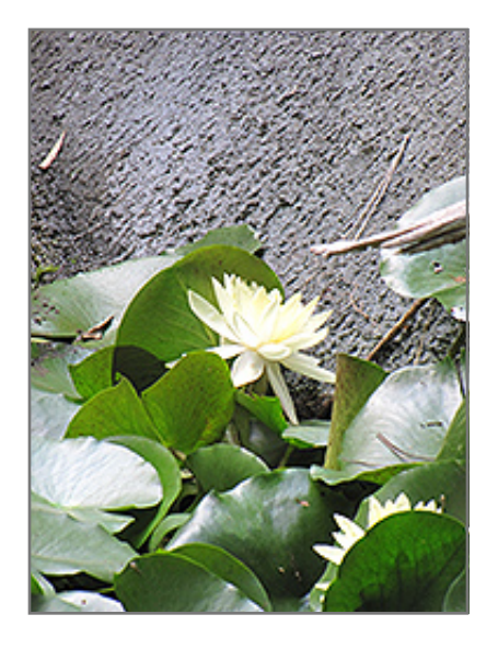
Trudy Slocum Tropical Water Lily flowers