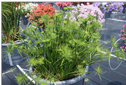
Queen Tut Egyptian Papyrus in bloom