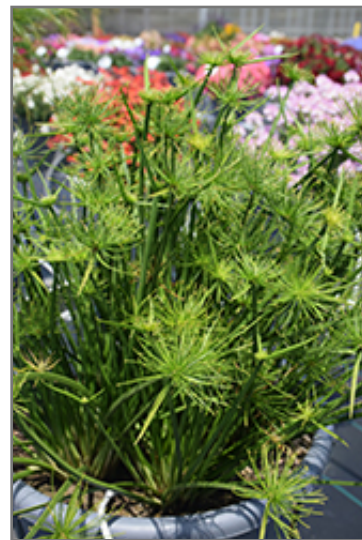
Queen Tut Egyptian Papyrus foliage