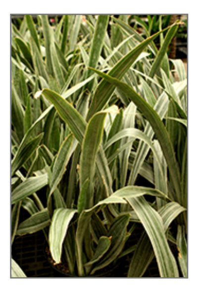
Sayuri Snake Plant foliage

When grown indoors, Sayuri Snake Plant can be expected to grow to be about 3 feet tall at maturity, with a spread of 18 inches. It grows at a slow rate, and under ideal conditions can be expected to live for approximately 10 years. This houseplant performs well in both bright or indirect sunlight and strong artificial light, and can therefore be situated in almost any well-lit room or location. It is very adaptable to both dry and moist soil, and should do just fine under average home conditions. The surface of the soil shouldn't be allowed to dry out completely, and so you should expect to water this plant once and possibly even twice each week. Be aware that your particular watering schedule may vary depending on its location in the room, the pot size, plant size and other conditions; if in doubt, ask one of our experts in the store for advice. It will benefit from a regular feeding with a general-purpose fertilizer with every second or third watering. It is not particular as to soil pH, but grows best in sandy soil. Contact the store for specific recommendations on pre-mixed potting soil for this plant.