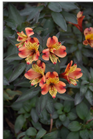
Indian Summer Alstroemeria flowers