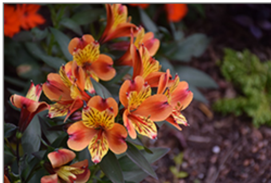
Indian Summer Alstroemeria flowers

Indian Summer Alstroemeria is recommended for the following landscape applications;