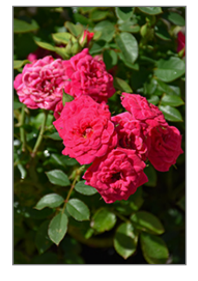
Sunblaze Dragon Fruit Rose flowers