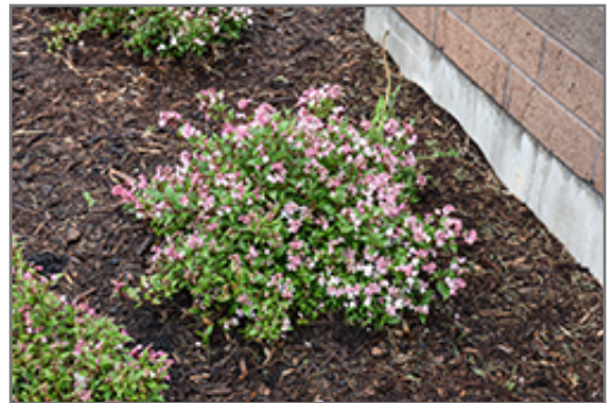
Yuki Kabuki Deutzia in bloom