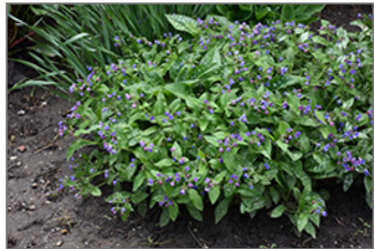
Dark Vader Lungwort in bloom