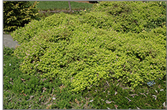
Golden Elf Spirea

Golden Elf Spirea is recommended for the following landscape applications;