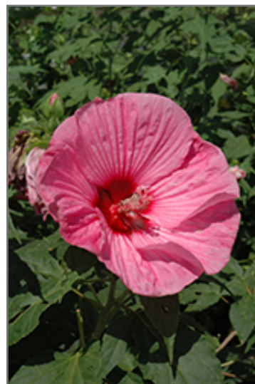
Plum Crazy Hibiscus flowers

This bold garden perennial features showy ruffled, lavender-pink flowers w/dark-red eye; attractive, glossy, large, dark-green/bronze leaves; ideal for the mixed garden border or in mass; do not allow to dry to wilting point