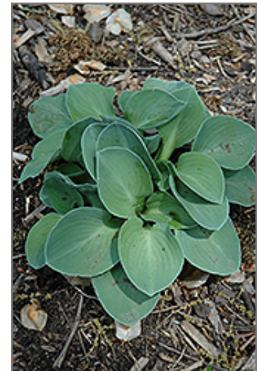
Blue Mouse Ears Hosta