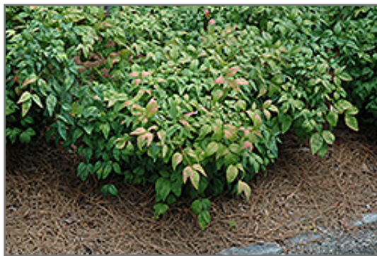
Fire Power Nandina