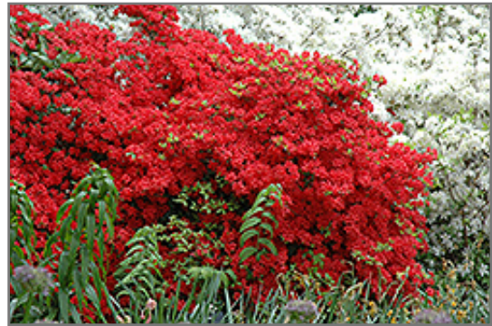
Stewartstonian Azalea in bloom