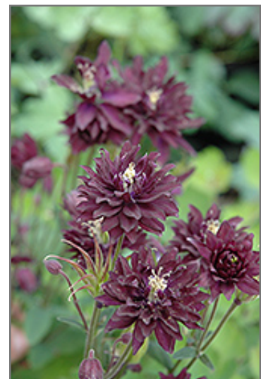
Clementine Dark Purple Columbine flowers