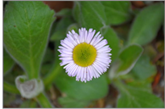
Lynnhaven Carpet Fleabane flowers

Lynnhaven Carpet Fleabane will grow to be about 7 inches tall at maturity extending to 15 inches tall with the flowers, with a spread of 15 inches. Its foliage tends to remain low and dense right to the ground. The flower stalks can be weak and so it may require staking in exposed sites or excessively rich soils. It grows at a fast rate, and under ideal conditions can be expected to live for approximately 10 years. As an herbaceous perennial, this plant will usually die back to the crown each winter, and will regrow from the base each spring. Be careful not to disturb the crown in late winter when it may not be readily seen!