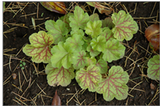
Electric Lime Coral Bells