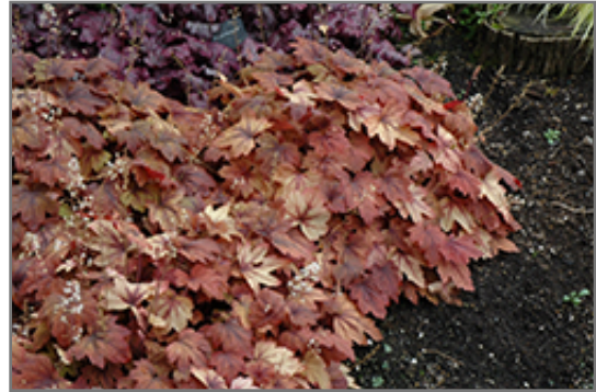
Sweet Tea Foamy Bells

Sweet Tea Foamy Bells will grow to be about 20 inches tall at maturity, with a spread of 28 inches. When grown in masses or used as a bedding plant, individual plants should be spaced approximately 24 inches apart. Its foliage tends to remain dense right to the ground, not requiring facer plants in front. It grows at a medium rate, and under ideal conditions can be expected to live for approximately 10 years. As an evergreen perennial, this plant will typically keep its form and foliage year-round.