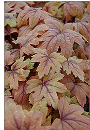
Sweet Tea Foamy Bells foliage