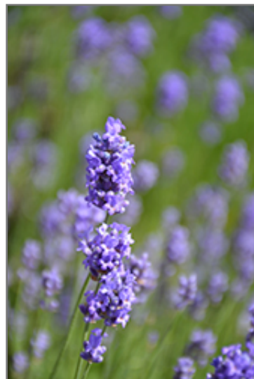
Hidcote Blue Lavender flowers