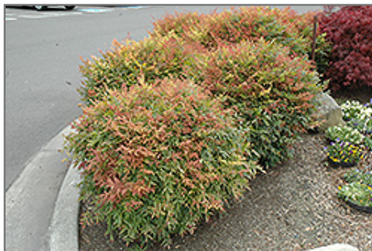
Sienna Sunrise Nandina