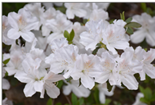
Delaware Valley White Azalea flowers