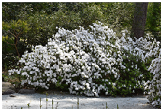
Delaware Valley White Azalea in bloom