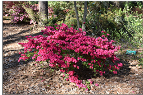
Girard's Fuchsia Evergreen Azalea in bloom