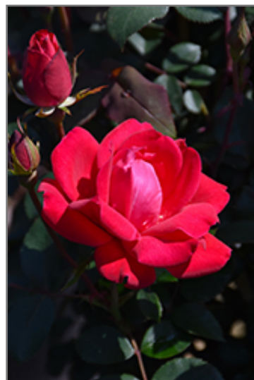
Double Knock Out Rose flowers

Double Knock Out Rose is recommended for the following landscape applications;