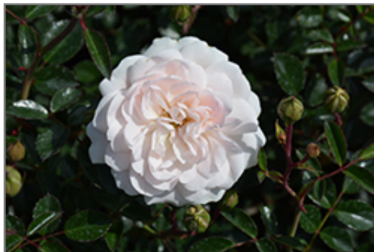
Sea Foam Rose flowers