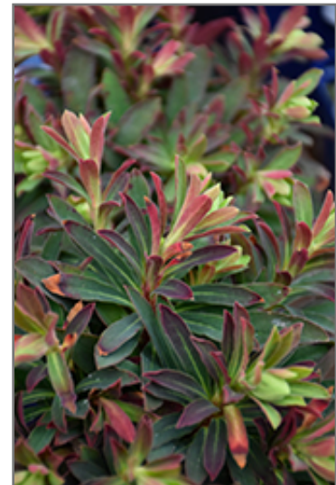
Tiny Tim Spurge flowers