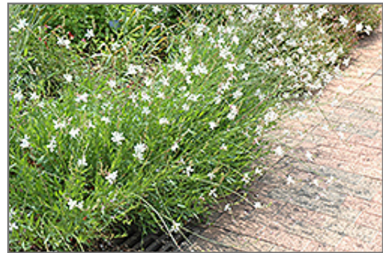
Whirling Butterflies Gaura in bloom