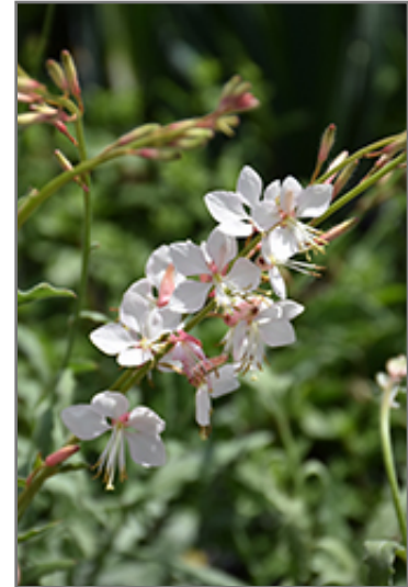
Whirling Butterflies Gaura flowers

This is a relatively low maintenance plant, and is best cleaned up in early spring before it resumes active growth for the season. It is a good choice for attracting butterflies to your yard, but is not particularly attractive to deer who tend to leave it alone in favor of tastier treats. It has no significant negative characteristics.