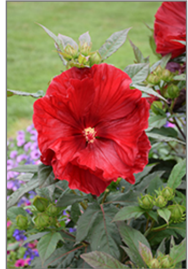
Summerific Cranberry Crush Hibiscus flowers