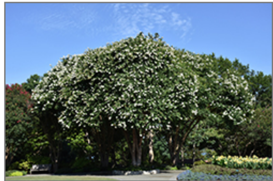
Natchez Crapemyrtle in bloom