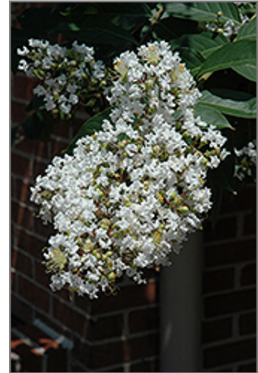
Natchez Crapemyrtle flowers

This is a relatively low maintenance tree, and is best pruned in late winter once the threat of extreme cold has passed. Deer don't particularly care for this plant and will usually leave it alone in favor of tastier treats. It has no significant negative characteristics.