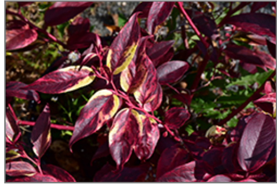
Rainbow Fetterbush in fall

Rainbow Fetterbush makes a fine choice for the outdoor landscape, but it is also well-suited for use in outdoor pots and containers. Because of its height, it is often used as a 'thriller' in the 'spiller-thriller-filler' container combination; plant it near the center of the pot, surrounded by smaller plants and those that spill over the edges. It is even sizeable enough that it can be grown alone in a suitable container. Note that when grown in a container, it may not perform exactly as indicated on the tag - this is to be expected. Also note that when growing plants in outdoor containers and baskets, they may require more frequent waterings than they would in the yard or garden.