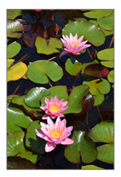
Pink Sensation Hardy Water Lily flowers