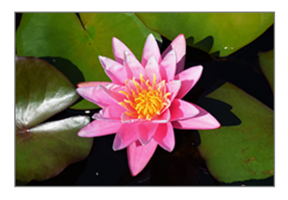
Pink Sensation Hardy Water Lily flowers