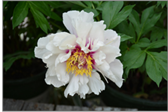
Cora Louise Peony flowers