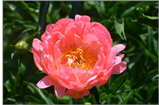
Coral Sunset Peony flowers