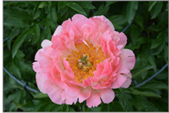
Coral Sunset Peony flowers (faded)