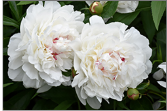
Festiva Maxima Peony flowers

Festiva Maxima Peony is recommended for the following landscape applications;