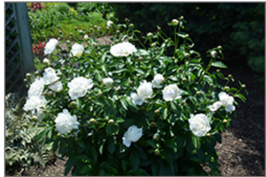
Festiva Maxima Peony in bloom